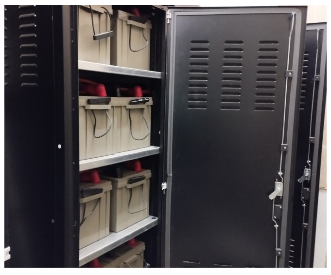
External battery racks that required for a longer runtime

and space for four power modules. The system is occupied by two M10U (Unity Power Factor)<sup>2</sup> power modules and one supercharger module. It's important to note that normally UPSs chargers are designed only for a maximum of 30 minutes of backup time. In which case, if these UPS are loaded with a larger battery bank you can either have UPS charger failure or your battery bank will not give you the expected life because of improper charge current.